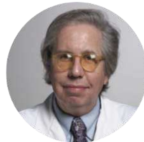
Mark W. Green MD, FAAN

Even though the brain is not sensitive to pain, many structures that surround the brain and are in the skull and scalp are sensitive to pain. These include the large arteries that feed the brain and those veins that contain blood leaving the brain, the coverings of the brain, the scalp including the skin, and muscle are pain sensitive.